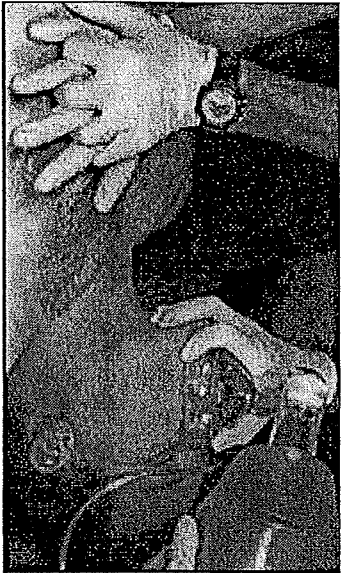
Carbon monoxide poisoning endangers lives.

Local municipal building officials are the best source of information concerning carbon monoxide alarms in new construction.